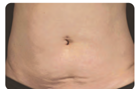
Before and after 2 Potenza treatments