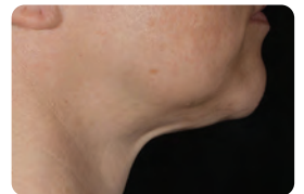
Before and after 1 Potenza treatment